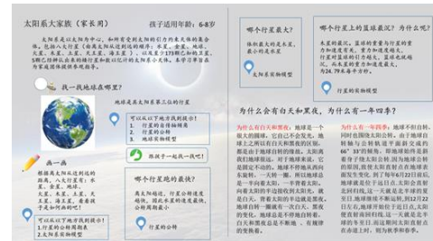
Figure 3. Revised Parental Guide-sheet