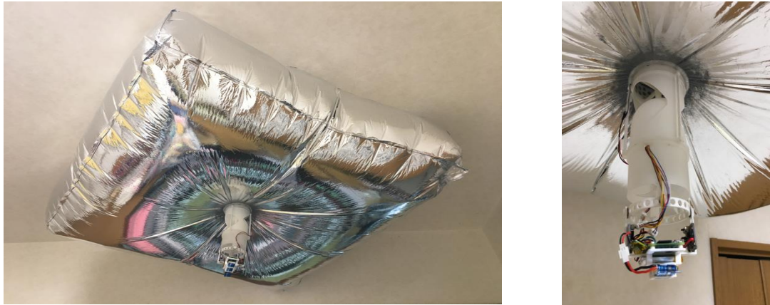
Figure 2. Prototype of “Balloon Type Drone”

The control unit uses Raspberry Pi Zero W, to which motor drivers, LiPo batteries and a camera are connected in lower part. The enclosure and propeller of this module are designed using 3D-CAD and 3D printers from scratch, and the whole weight of the module is 127g including batteries.