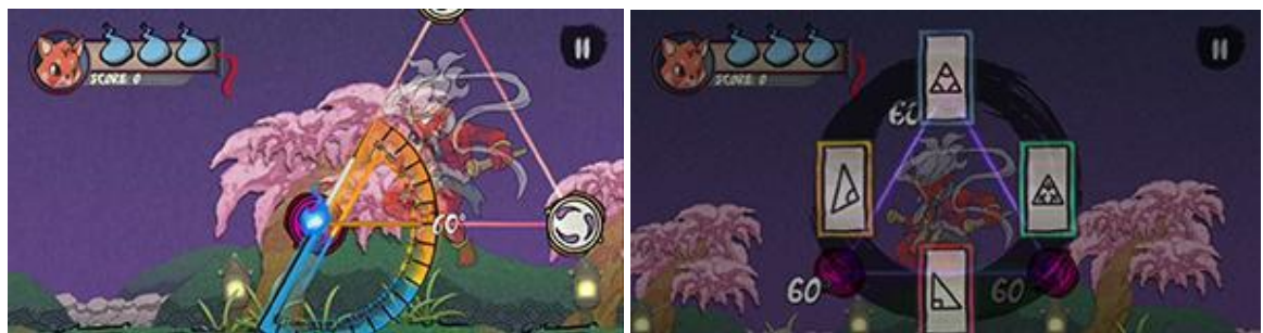
Figure 4. Triangle Angle Measure mechanic (left) measuring and (right) classification