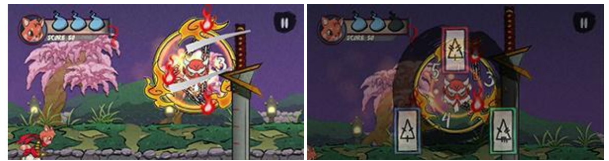
Figure 5. Triangle Side Measure mechanic (left) measuring and (right) classification

The first version or the Time-bound (TB) version is where the enemies of the game constantly attack the player at a normal time pace. Although this version provides challenging gameplay, it may be at the cost of learner development due to its fast nature. Time-bound encounters could inhibit the player's conceptual learning since they would be less inclined to reflect and find the optimal solution as their survival would be the priority. On the other hand, the Non Time-bound (N-TB) version is where time is significantly slowed down during enemy encounters, resuming only when the player is creating a gesture. In this version, the player is now given ample time to find a solution for the problem presented to them. However, the time to defeat the enemy is still limited, thus preserving the challenging aspect of the game.