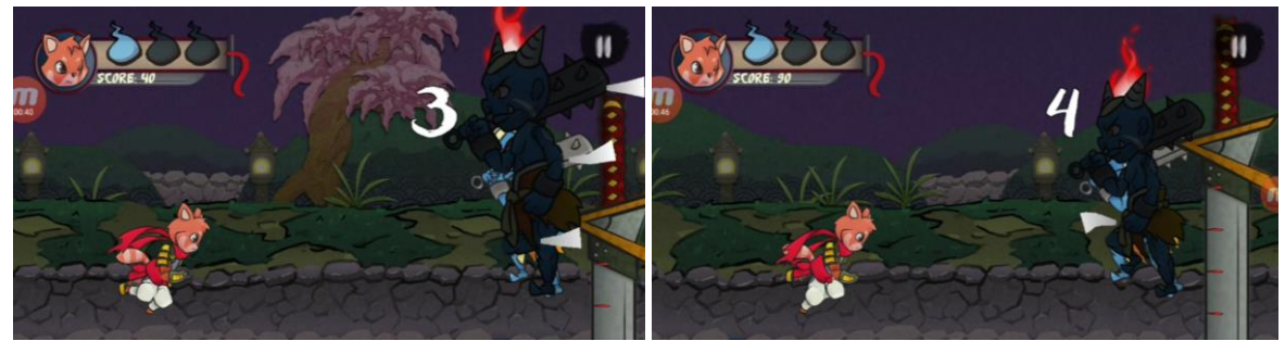
Figure 2. Length Measure mechanic

The game mechanic, its learning outcome and the concept, and the activity involved are based on the student model which can be found on table 1. The game revolves on two main activities: slashing and aiming (figures 2 and 3), which refers to measuring sides and angles respectively. The two main activities are extended to more complex triangle mechanics (figures 4 and 5). These mechanics had several variations during the development process. Design considerations (such as the game having two versions) made and issues encountered are described in the succeeding paragraphs.