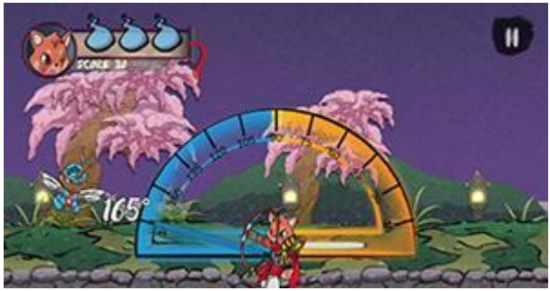
Figure 3. Angle Measure mechanic