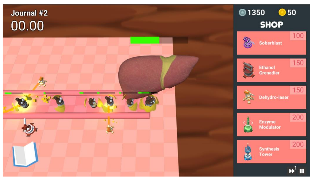
Figure 1. Beer bottles attacking the liver.

The emphasis of the gameplay is the defensive strategy the player employs. The player must understand how the enemy behaves and apply an effective strategy to stop them before they reach the liver. Some enemy substances are weak and fast, while others are strong but slow. The enemies take the form of an alcohol bottle. The alcohol bottles are designed according to the strength of each enemy. Strong enemies have more alcohol content in real life, while weak enemies have less alcohol content. Figure 1 shows an example of an attack.