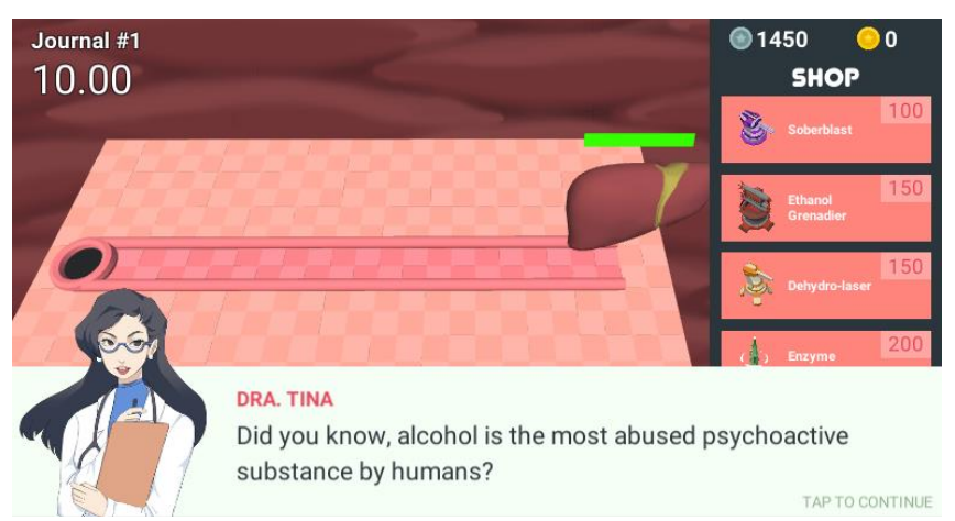
Figure 2. The doctor in the game.

The doctor figure in the game (Figure 2) serves as a general guide to the player. At the start of the game, the doctor administers a tutorial. Next, after showing the journal entry at the start of each wave, the doctor gives facts pertaining to alcohol use.