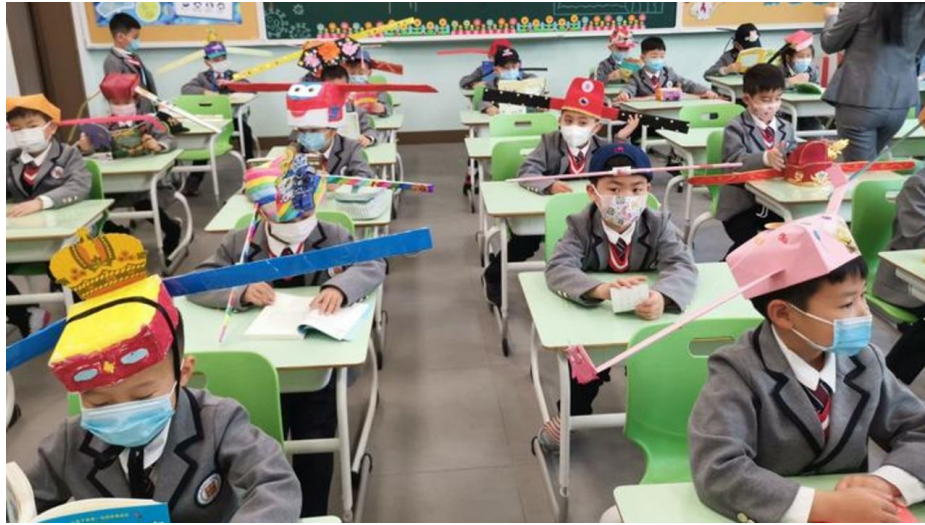
Figure 1. 'One-metre hats' as augments to safe-distancing in a Chinese school.